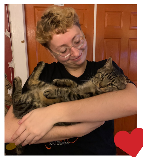
Crinkle Bob is cherished

Crinkle unwrinkled many worried hearts in Suite FIV. Over