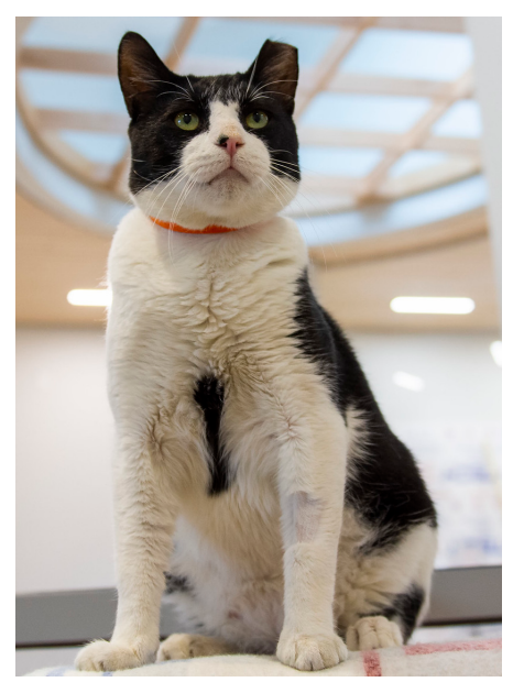
Tucker treasures his new life in Quinn's Corner at Tabby's Place

It could have been a very different Valentine's Day for Tucker. But thanks to people like you, he's got us all tucked in his heart's front pocket. With your help, we'll welcome many more FeLV+ Valentines in the months ahead. Please click here to give them your heart.