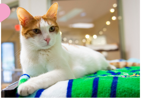
Kozmo traveled from Beirut for life-saving surgery...and unconditional love

Animals Lebanon had heard of Tabby's Place's devotion to the most