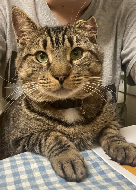
The one, the only, the magnificent Crinkle Bob!

It brings me so much joy to now be able to teach others about