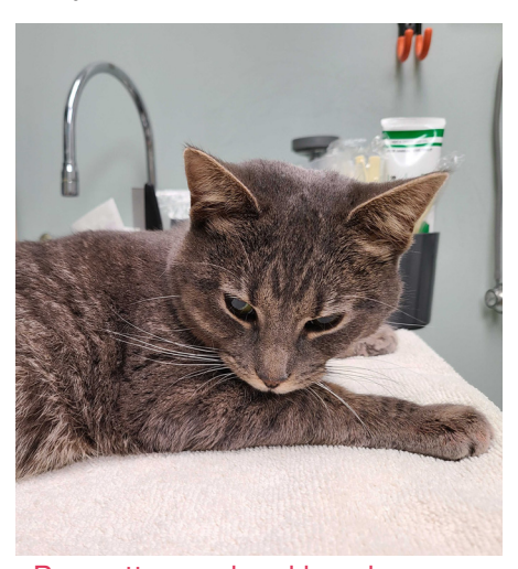
Prescott purred and loved us even as she arrived in agony

In a cold New England winter, Prescott walked alone. But one terrible day, someone or something hurt the soft little moonshadow... badly.