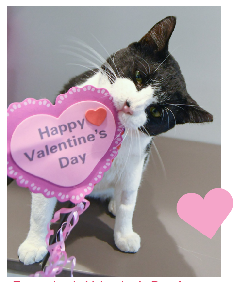
Every day is Valentine's Day for our valiant FeLV+ boy

Big hearts brought Tucker to Tabby's Place after he tested positive for feline leukemia virus