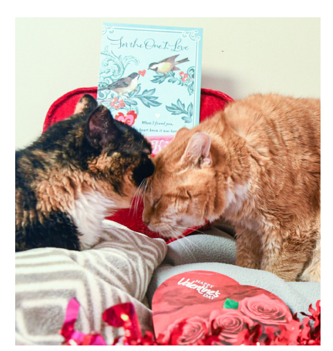
Sponsor our Elderly Care Fund, and you'll lavish love on <u>Agnes</u>, <u>Toulouse</u>, and all our golden oldies

you unconditionally...and they hope you feel the same. Click here to meet your meowing match today!