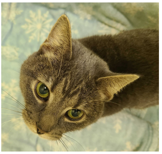
Precious to everyone at Tabby's Place, Prescott loves being loved

Today, Prescott's future is as bright as her starry eyes. Intensive care saved her life, and she's flourishing in a foster home with skilled caregivers. Tenderhearted Prescott is forgiveness on four