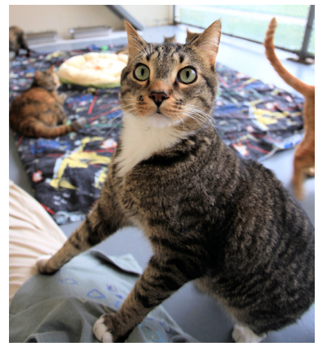
Our beloved bottle rocket was always on the hunt for fun

just jostled off to the next potential partygoer. This was all made more hilarious by his awkward gait. He walked as if he had a permanent "wedgie."