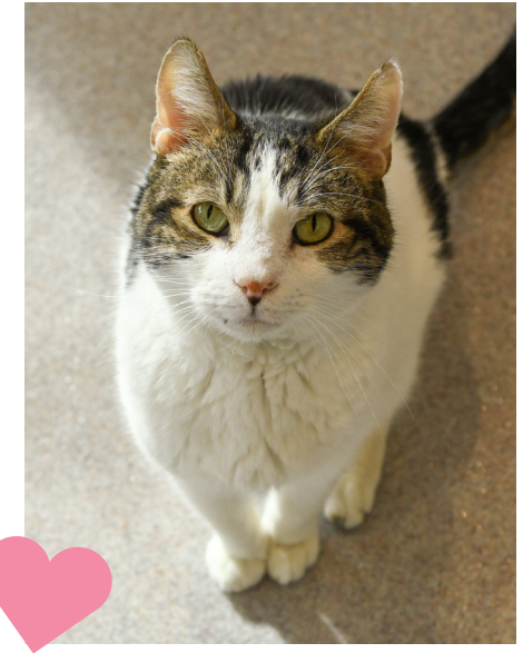
Durin would be devoted to you catnip hearts and squeeze-tuna. Click here to meet our 100+

You can't put a price on love, but your new feline family member hopes you'll put this savings towards