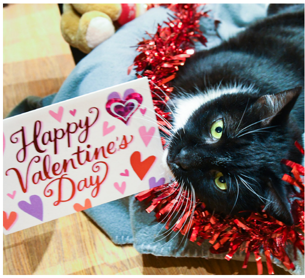
Your Donor-Advised Fund can save Special Needs cats like Antin

Navigator rating, Tabby's Place is a trustworthy steward of your generosity.