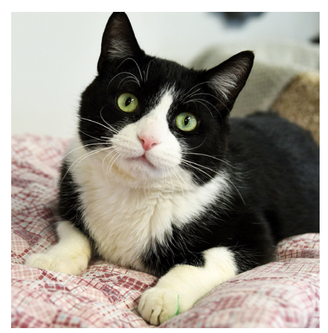
In 2022, your generosity saved Gulliver (and so many others)

might say, "thanks for positioning us to save more cats from hopeless situations than ever before."