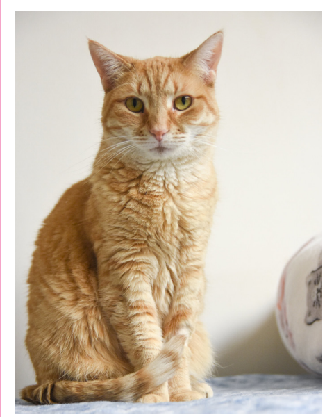
Cleopatra would love to be your queen

With prices rising on everything from fuel to Fancy Feast®, it's