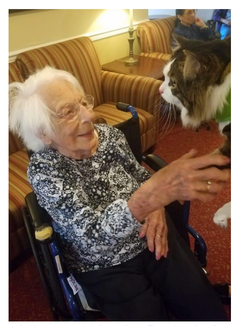
Anka, one of Aged to Purrfection's ambassadors of joy

Every week, a hand-selected band of cats hops into strollers and sets out on an adventure. Their mission: comfort and joy. Their success rate: 100%.