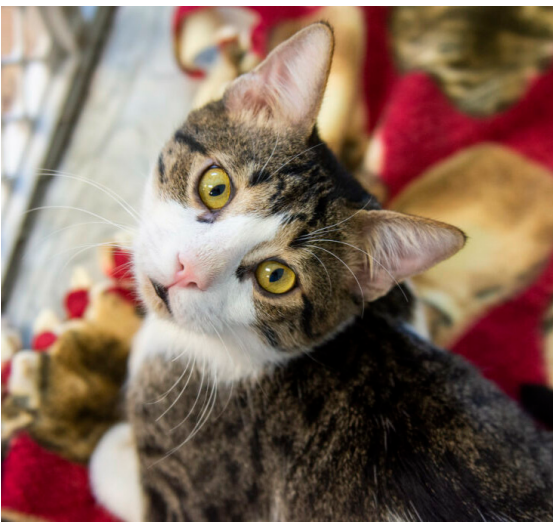
Kiko, our little champion

One trans-Atlantic flight later, Kiko has joined a long line of cherished CH kitties at Tabby's Place. He takes the classic proverb "Fall seven times, stand up