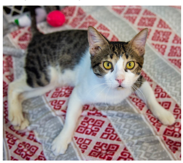
Kiko is on a campaign to become the king of all hearts...starting with yours!

Thanks to you, Tabby's Place is the hope and glory of cats like Kiko all over the world. And thanks to you, Kiko's future looks "very sweet...very stable!"