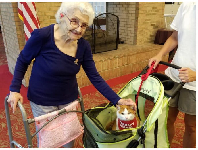
Love is Carrot's mission, and he always succeeds

It's yet another reminder that, as much as we think we're the ones