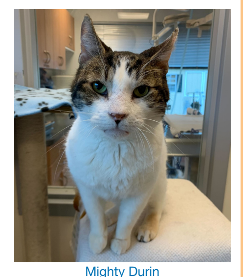
cats, there's a land lovelier than Tolkien's Lothlorien: Tabby's Place's