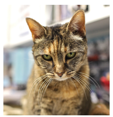
The late, luminous Lacey, one of T & L's first Special Needs sponsorees

They're blushing a thousand shades of scarlet as they read these words, but they are as true as their love for cats...and a daily inspiration to us at Tabby's Place.