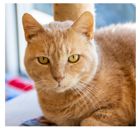
Ponce de Leon promises to be the perfect pen pal for you or a loved one

big way at Tabby's Place. Please sponsor your new best friend today!