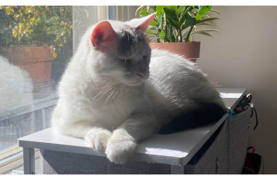
Frankie reigns in his forever home, where he has apparently learned to open all the cabinets

But Frankie wanted all felines to remain strangers in the night. Brassy and bossy with his furry neighbors,