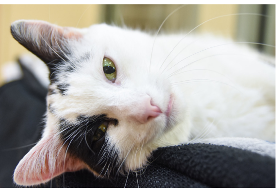
Radiant Rose would love to be your sponsoree

big way at Tabby's Place. Please sponsor your new best friend today!