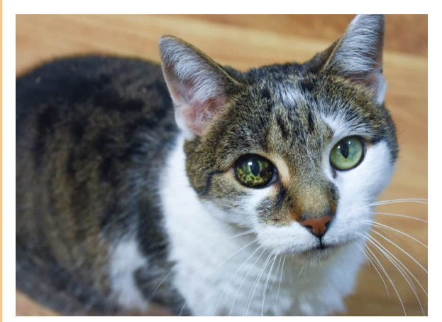
Bucca was beautiful — and extremely zestful — right up to age 21