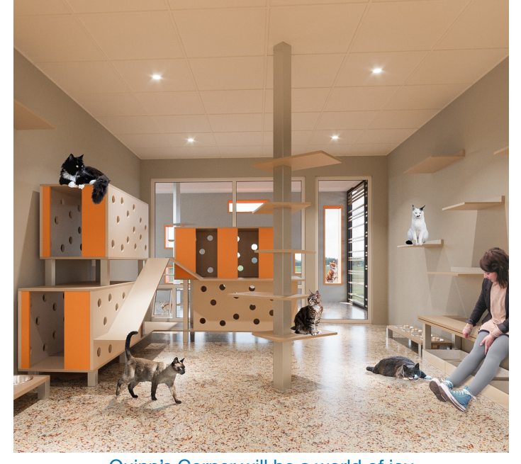
Quinn's Corner will be a world of joy for the cats who need us most