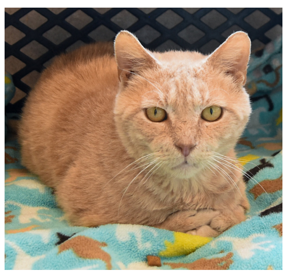
Ponce is pouncing on a beautiful future thanks to people like you