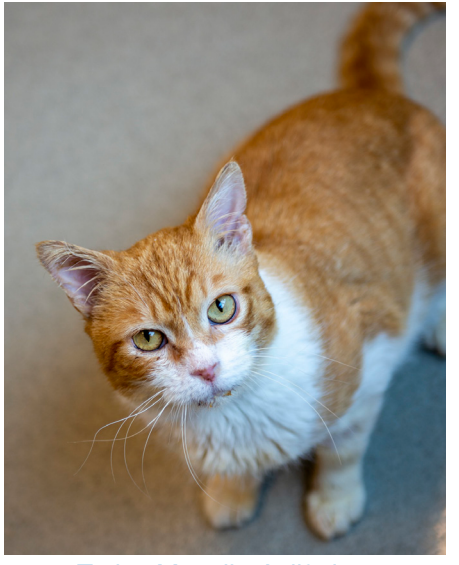
Today Magellan's life is a voyage of love

Magellan is just one FeLV+ cat, with numberless friends who need