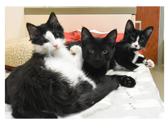
Donegal, Dublin, and Doolin dream of their forever family

But there's a reason the word "feleuk" strikes fear in the hearts of adopters. These lovable cats can live long, healthy lives...or succumb to their disease in the near future. FeLV suppresses cats' immune