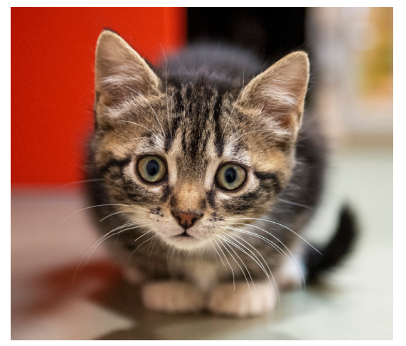
Tabby's Place is about to get even sweeter for every cat in our care

• Raising the roof: The roof over our cats' heads has taken a beating through the years, surviving several hurricanes and bomb cyclones. Now is the time for us to replace it, sheltering our cats for years to come.