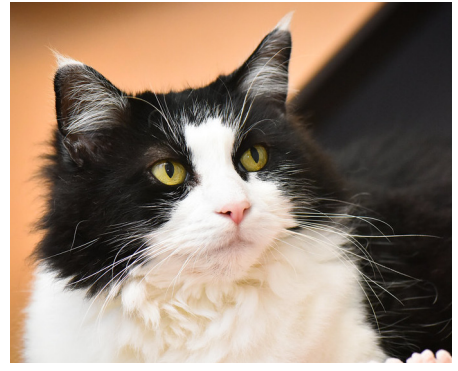
The upgrades we make today will comfort and delight thousands of cats in the years to come

cats. In this way, Quinn's Corner will help to nurture thousands more cats than will ever pass through our doors.