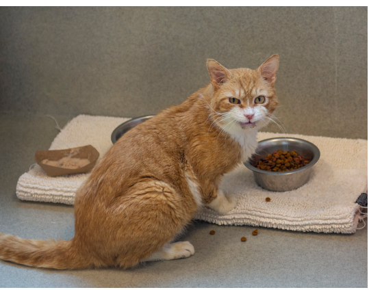
You can make life delicious for FeLV+ cats like Magellan