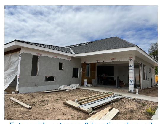
Future side entrance & location of paved plaza, where cats will enjoy stroller walks