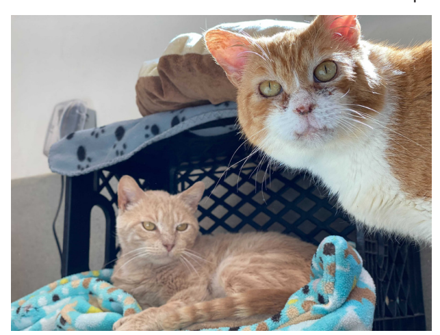
Ponce and his fellow FeLV+ pioneer Magellan

If you're fortunate enough to have the means, please consider a lasting act of love.