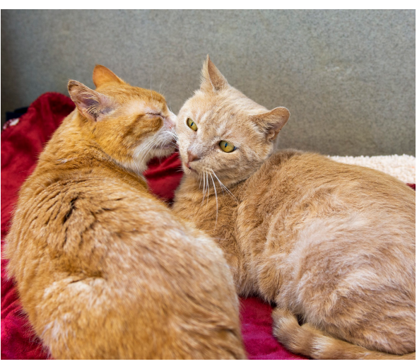
It's no secret — FeLV+ cats like Magellan and Ponce will have a life of joy at Quinn's Corner

Your gift of any size will light up the sky with kindness at Quinn's Corner. Please help make history by donating online at <a href="https://qc.tabbysplace.org/ways-to-give/">https://qc.tabbysplace.org/ways-to-give/</a>, or by mailing a check to