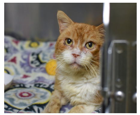
Magellan arrived in need of tender care

With a soft heart and a creamsicle-colored coat. Magellan should have been sailing the high seas of sweetness. But life had been less than kind, and the aging cat found himself foraging for food behind a motel.