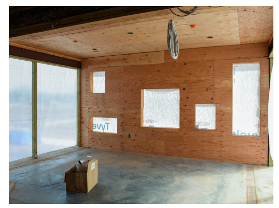
Solarium window seats where cats will blissfully bask and dream

FeLV+ cats, who have been truly hopeless for so long. It still seems unreal to me. But all I have to do is swivel around in my chair and gaze at the "mess" outside to convince myself it is really happening.