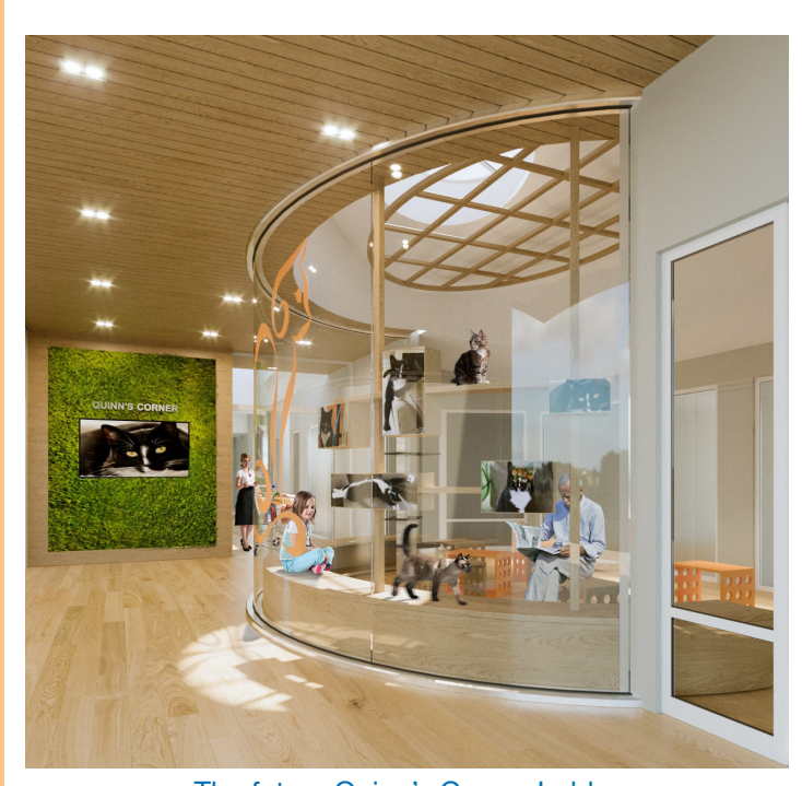
The future Quinn's Corner Lobby

The new world looks a whole lot like love.