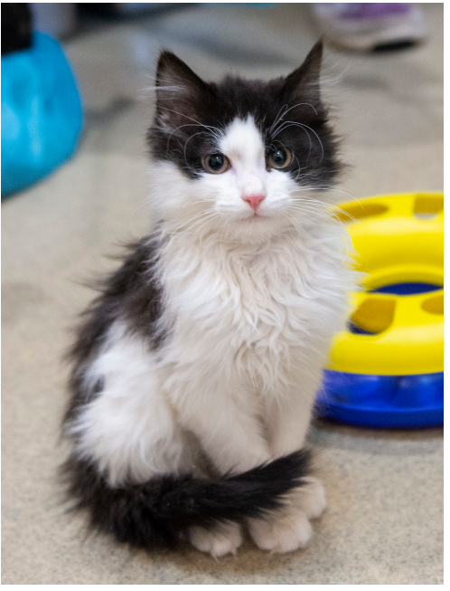
Darling Donegal stands ready to deliver love

Since the course of FeLV is difficult to predict, adopters need to accept an uncertain future. But 18 years of cherishing cats at Tabby's Place have reminded us that we only get one guarantee in this life: love. None of us is promised tomorrow, but we