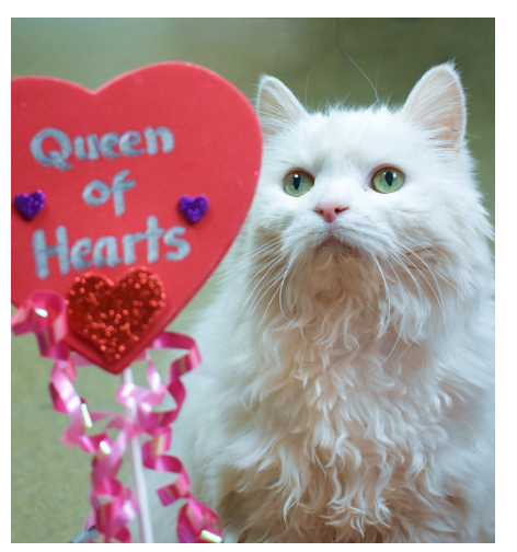
Faye longs to be your feline Valentine