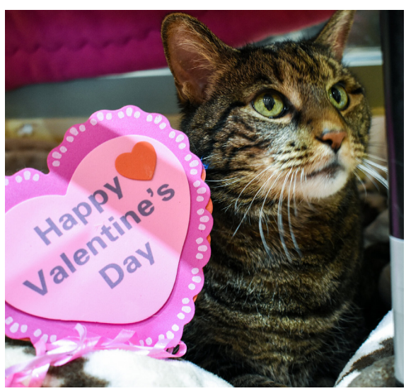
Marley has landed in the lap of love at Tabby's Place

Tabby's Place is a harbor for every cat we've loved, wherever their voyages may take them. Our lighthouse flashes a promise: "Once a Tabby's Place cat, always a Tabby's