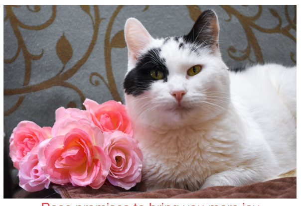
Rose promises to bring you more joy than a dozen blossoms