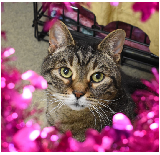
Conga's adopters were no longer able to keep him, but Tabby's Place kept our promise to this gentle boy

Our promise extends to cats who have scarcely stepped