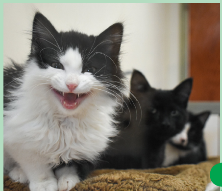
FeLV can't keep Donegal and his brothers from rejoicing

lucky. The disease is transmissible by casual contact and poorly understood, and infected cats are typically euthanized at shelters. Even Tabby's Place has, until now, had limited space for these wonderful cats, who require specialized housing.