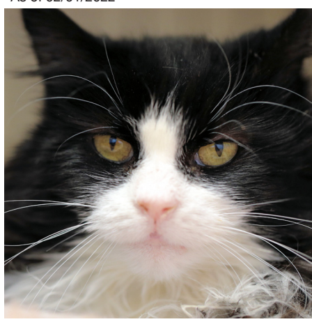
Always stunning Sophia