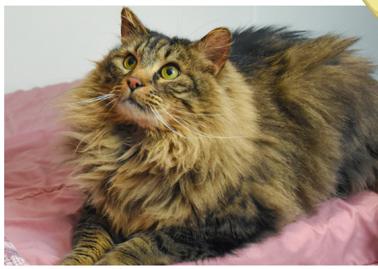
Adults like Oscar have (mostly) mellowed out of madcap kittenhood