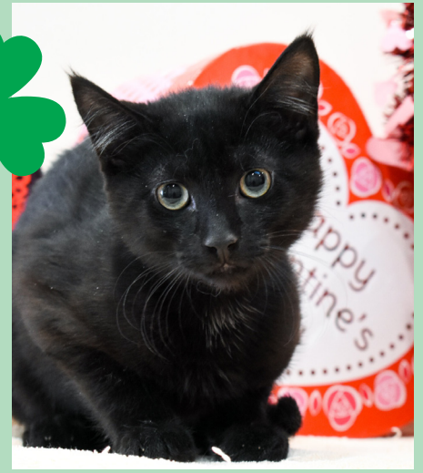
Dublin delights in the luck o' the Irish and the love of a lifetime at Tabby's Place

will provide safe, loving accommodations for FeLV+ cats like the Dublin Dudes. Click here to learn more and to help.