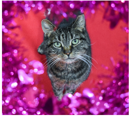
Boobalah beckons you, 'be mine!'

both you and your recipient, so you can share in love-filled adventures every month.