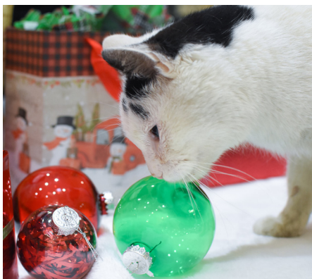
Rose is excited to make your family's holiday season warm and wonderful

Your loved ones don't want another candle, and your online orders may be stuck in supply-chain