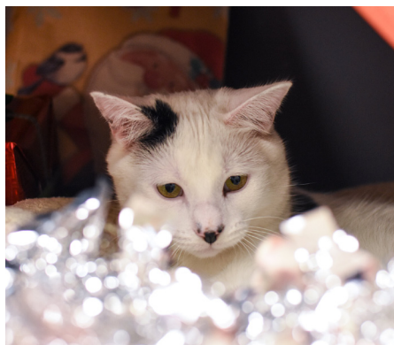
Give a gift sponsorship, and let little Elliot fill their hearts with wonder

Luna would not look kindly on attempts to put a big red bow on her head. (Red doesn't match tortoiseshell, anyway.)