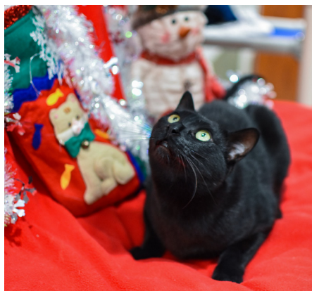
Carbon delights in your kindness

When you give a Special Needs Sponsorship , you'll provide