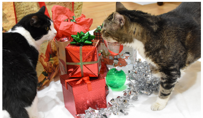
Pepita and Bellamy hope you'll double your love