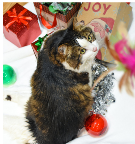
Whatever your best donation may be, Anka thanks you with all his heart

cats and yourself. It's a win-win (and the Tabby's Place cats are always in your corner!)