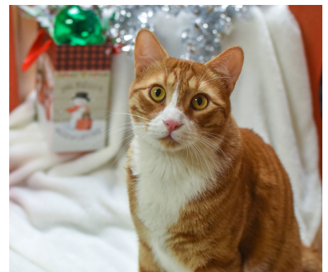
Nemo can help you honor your loved one this holiday season

Sweater socks and figurines? Not this year: you've got love on your list, and the cats will thank you all year long.