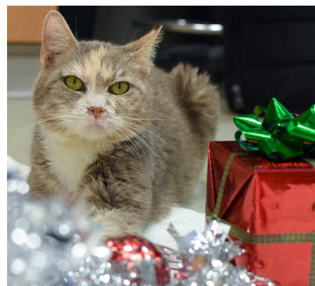
Luna would love to be the best holiday surprise of 2021

food, life-saving medical care, and boundless affection for a cat who needs you. In return, you and a loved one will both receive monthly email updates and photos of your new feline family member.