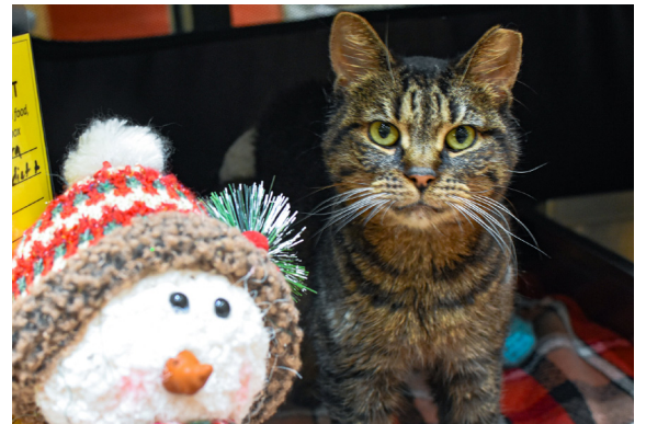
Boobalah hopes you'll remember the cats this holiday season

Click here to learn more about the process of delivering L-O-V-E through your RMD!