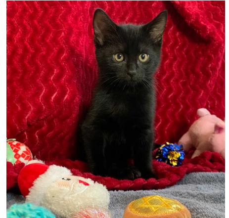
Tater will have a loving holiday season thanks to wonderful people like you!

As of this writing, we're still determining the exact nature of Tater's "disability," but don't let her hear you use that word. As far as she's concerned, Tater is triumphant in every way. Like her Tabby's Place elders Anka , Olive , and recently-adopted Cotton , she just moves in her own magical way. If reindeer can fly, why can't one little licorice-drop of a kitten scoot and shimmy?