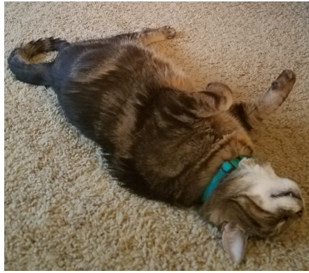
Jingles' warmth and wonder live on forever

"When I was about ready to leave after my lengthy visit, I exclaimed, "I just want a sweet old man kitty!" Immediately, a kind older gentleman volunteer asked if I'd met Jingles. We went to Jingles' suite, and it was like someone had