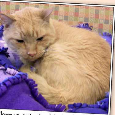
Chance enjoying his fresh start at life in the light at Tabby's Place.