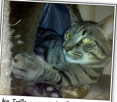
Like <u>Trifle</u>, your cat will enjoy having a post or tower designed to meet his scratching needs.

Declawing is an irreversible surgery to amputate the last joint of the cat's "toes" – the very body part on which