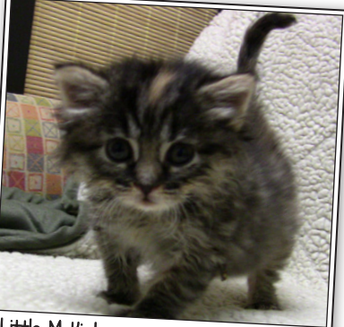
Little <u>McKinley</u> was part of our most recent kitten season at Tabby's Place.

• A female cat can go into heat <u>every three weeks</u>. Unlike dogs, a cat will con-