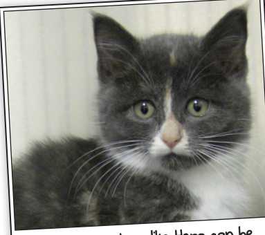
Even youngsters like <u>Hera</u> can be successfully trained to scratch where you want them to scratch.

- Touch: temporarily place aluminum foil or double sided tape on the surface.