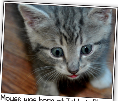
Mouse was born at Tabby's Place, but most homeless kittens will not be so fortunate. TNR can help prevent their plight.