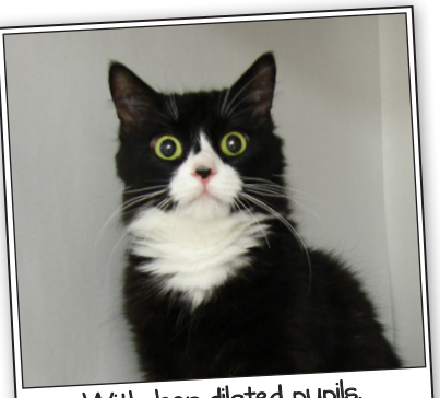
With her dilated pupils, Twix is surprised and excited to see her visitor.

Very content and feeling safe. Friendly cats initiate "eye-blink hellos" with one another, and use the blink to maintain good relations with others.