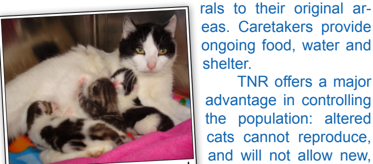
We're delighted that Bunny and her babies are at Tabby's Place. TNR can help prevent litters who may not be so lucky.