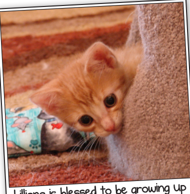
Lilliana is blessed to be growing up at Tabby's Place