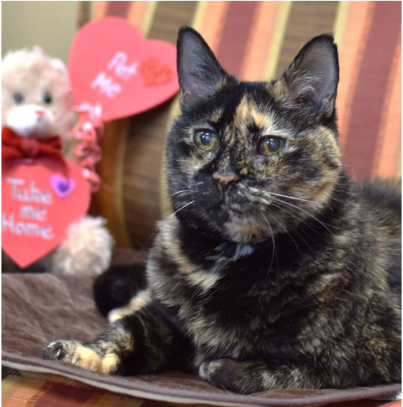
Fill your lap with <u>Zencada</u>, and she'll fill your heart with love — and health

25 – 150 Hz, the same range that's been found to be therapeutic for bone growth and healing; reduction of inflammation, pain and swelling; tendon repair; joint mobility, and the growth and repair of muscle tissues like those in your heart.