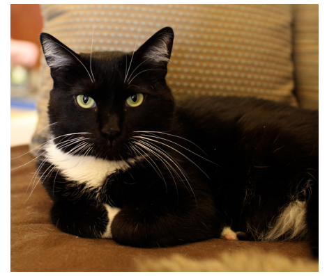
Heart disease didn't stop <u>Boots</u> from finding his forever home

Then there's the trouble with taurine. Other species can synthesize this amino acid from