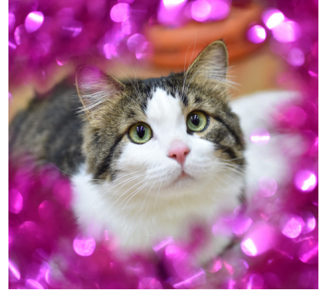
Anka would love to be your all-time Valentine

Make this your most meaningful Valentine's Day by cherishing a cat in need. You can meet all our sponsorable sweetie-pies <u>here</u>. Make your match and make a cat feel loved all year 'round!