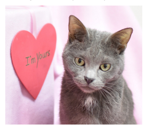
Playtime shows <u>Boom</u> that he's beloved

Predictable, daily playtime will also make your cat feel loved. Strive for at least 10 minutes of daily play utilizing a wand toy. The toy should