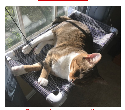
Sunny days are now the norm for <u>Sebastian</u>

No. 16.1 | 1st Quarter 2018 © 2018 Tabby's Place For a free subscription, go to: www.tabbysplace.org