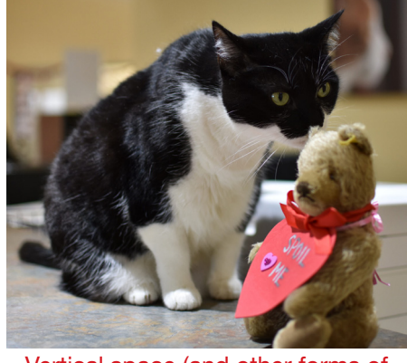
Vertical space (and other forms of spoiling) help Divya to feel loved

Cats are very three dimensional; they require vertical space to feel secure. Place cat trees in areas significant to your cat, not tucked away in corners. Likewise, scratching posts should not be hidden. Your cat is sure to love a post placed by your main entrance or between her sleeping and dining areas.