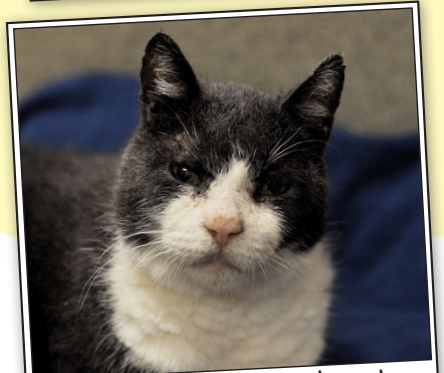
<u>Nuttin</u> has diabetes, heart disease, IBD, FIV and cancer but he's living well and loving life.