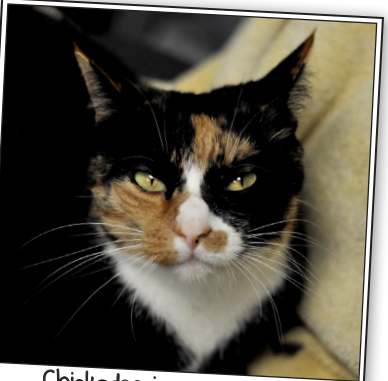
<u>Chickadee</u> is our newest CH sweetheart.

CH sweethearts do need a bit of extra attention, clean-up time and medical care - and they'd love your friendship. If you have room in your heart for a cat with "the cute disease," please sponsor Chickadee, Gabriella, Ike or Edward today - or "collect them all" with a fourin-one CH sponsorship by clicking here.