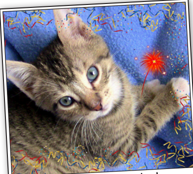
Little Sesame wants to make your <u>holiday gift</u> giving fun and easy.

Click here to experience the cats' gift catalog. They've