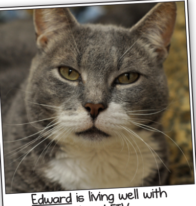
CH and FIV.