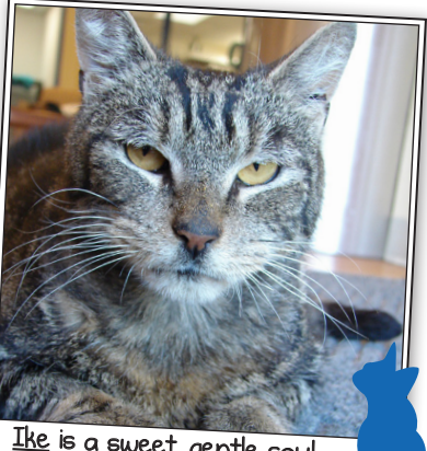
<u>Ike</u> is a sweet, gentle soul