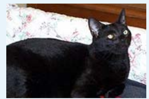
We always knew Blackjack was full of fun - and now he gets to share his cheerful ways with an especially animal-friendly family!

Greeeeen acres is the place for...Blackjack? Yes, and our beloved raven boy is living it up, country-style, in his fantastic new home. The first cat to successfully "graduate" from Tabby's Place's weight management room<sup>2</sup>, beautiful Blackjack made quick work of endearing his new family to himself. Even the non-human and non-feline members of Blackjack's new crew have welcomed him with open arms...and snouts...and horns. Blackjack is sharing his new abode with a pig, a pair of goats, as well as cats and dogs (plus a family of very loving, patient people!). We hear that, in typically exuberant, friendly Blackjack style, he is having a ball.