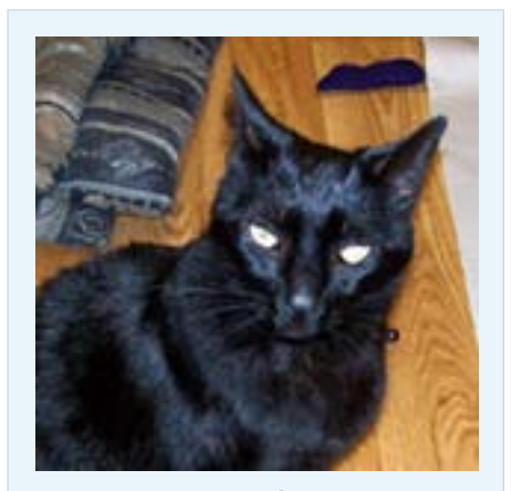
Darling Onyx<sup>1</sup> doesn't let FLUTD slow him down.

If you have researched cat diseases, you may have come across the acronym "FLUTD". FLUTD, which stands for "feline lower urinary tract disease," is a common diagnosis for cats with one or more of the following symptoms: