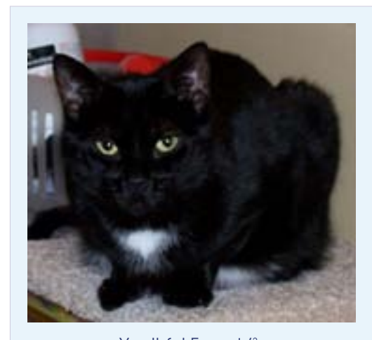
Youthful <u>Francis'</u><sup>3</sup> FLUTD is in great control.

I hope that this brief article has given you a better understanding of this not uncommon disease. With regular veterinary attention and a bit of extra care, a cat with FLUTD can live a long and healthy life.