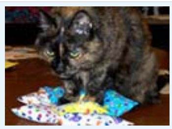
It's fun, it's organic, and it's 100% Franny<sup>1</sup> approved. Get your kitty his own Catnip Couture today!