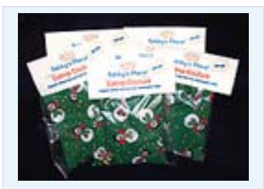
Catnip Couture is perfect for the feline with magnificent taste.