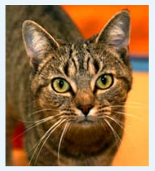
Little Hootie is a ball of energy and a delight to all who meet her.