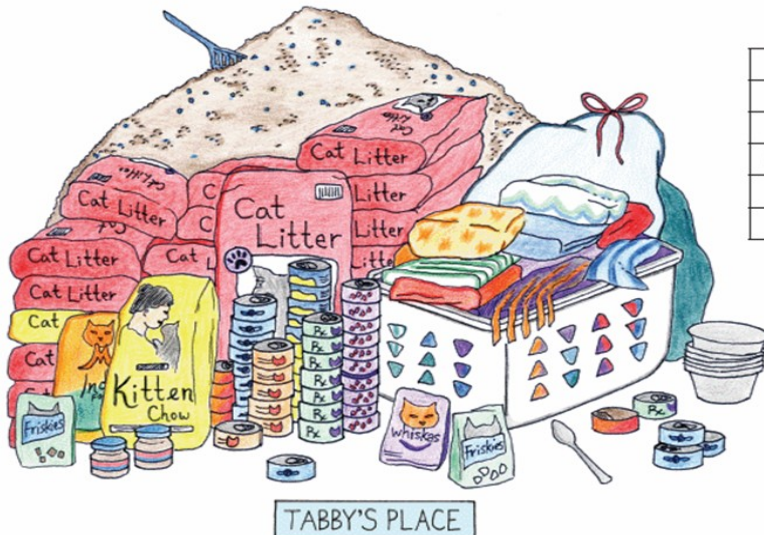
Monthly Usage Chart

Folks are often humble when they drop off a sack of litter or a few bags of toys. “I wish I could bring more,” they say. You should know how deeply we appreciate each donation, from blankets to bleach, canned food to catnip. Check out this to-scale representation comparing our usage of basic necessities with that of an average cat-owning home: